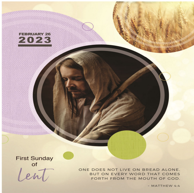
Copyright © J. S. Palach Co., Inc. Excerpts from the Lectioy for Mass © 2001, 1998, 1997, 1986, 1970, C.C.D.